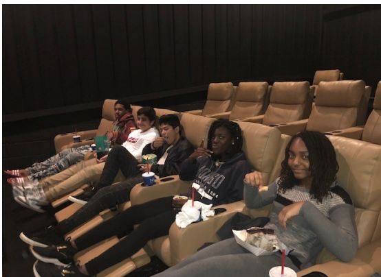
Roswell positive obs. enjoy a novel to cinema experience